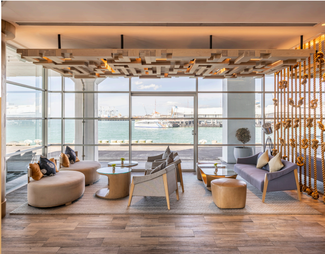
Seabreeze Lounges CAPACITY | 15 PAX

Experience pure relaxation in the Seabreeze Lounge, nestled along the wharf with breathtaking views of the harbour. This intimate space invites you to unwind in style, sipping your favourite drink as the sun sets beyond the horizon. Perfect for small gatherings or a cozy celebration, the Seabreeze Lounge offers an ambiance of comfort and elegance.