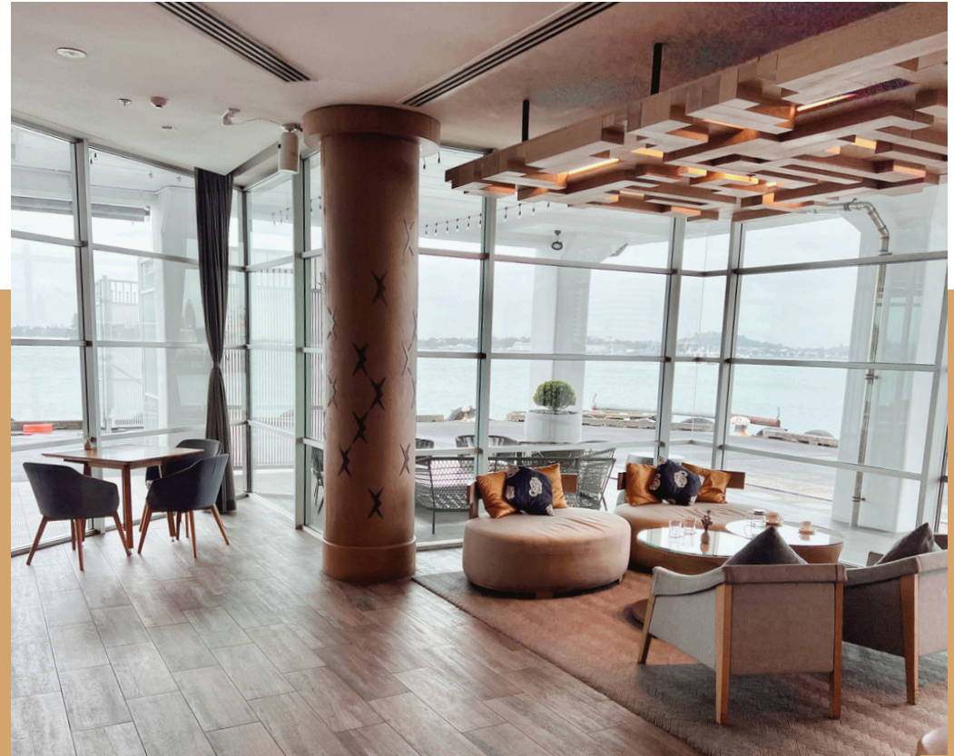
Seabreeze Cove CAPACITY | 30 PAX

Experience pure relaxation in the Seabreeze Lounge, nestled along the wharf with breathtaking views of the harbour. This intimate space invites you to unwind in style, sipping your favourite drink as the sun sets beyond the horizon. Perfect for small gatherings or a cozy celebration, the Seabreeze Lounge offers an ambiance of comfort and elegance.